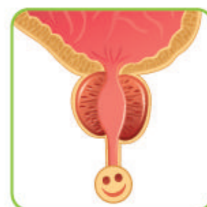
術後(排尿暢順) After Surgery (No obstruction)