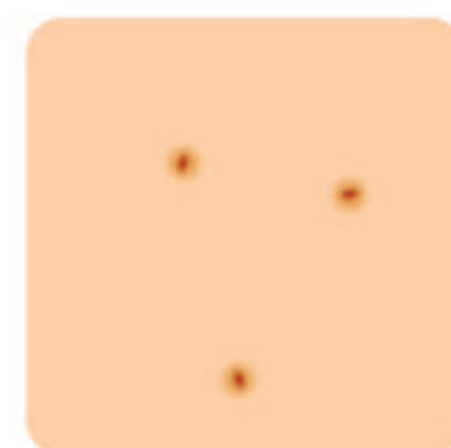
微創腹腔鏡腎臟切除手術 Laparoscopic Nephrectomy