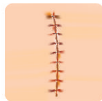
傳統開刀腎臟切除手術後傷口 Open Nephrectomy