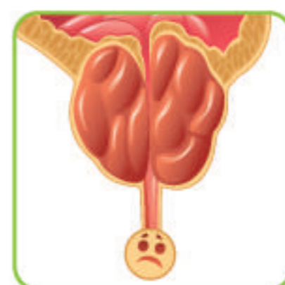
術前(前列腺阻塞) Before Surgery (Obstruction)